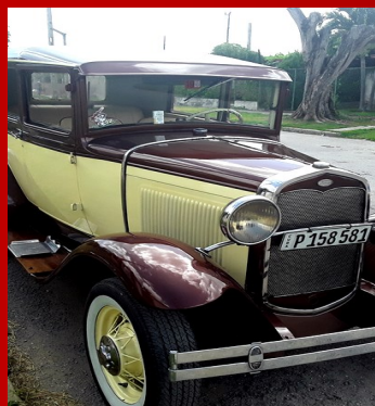
Old Classic Car