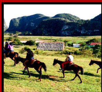
Excursion to Viñales

7 day: 09:00am Two hours of salsa's lesson and 2 hours traveling on Old Classic Cars like: Pontiac, Cadillac, Buick and others rollings jewel of Havana. You'll count on with a touristic guide that'll show you the most authentic of The Havana. You'll understand why Cuba is known as living museum of the old Classics Cars, There is not place to live this experience of the 50's years lurching in a restaurant of the zone. Dining at restaurant of the touristic zone, night activity