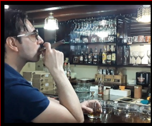
Cigars & Rum's Tour

1 day: Transfer from airport to a rent house at Habana, check in, dining at Doña Ana Restaurant –Bar, and night activity.