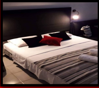
House of Rent